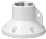
WV-QCLI01-W Mount Bracket