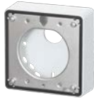
WV-QIB500-W Mount Bracket